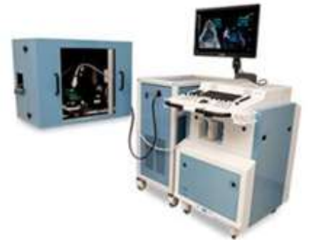
Fujifilm VisualSonics Vevo2100 LAZR