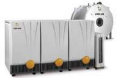
Agilent 4.7T MRI