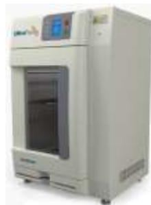
Faxitron Ultrafocus Digital X-Ray