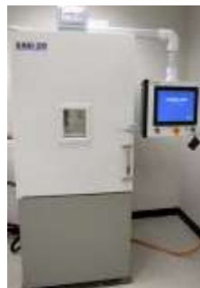
Precision Xray XRAD320