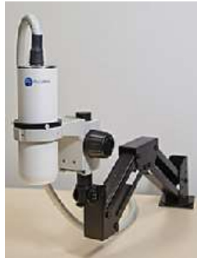
Fluoptics Fluobeam (NIR)