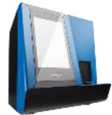
Abaxis HM5 Hematology Analyzer