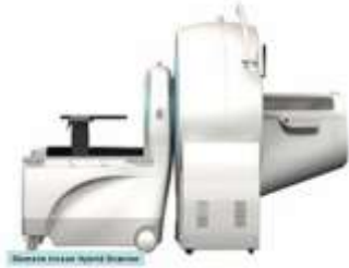
Siemens Inveon microPET/CT