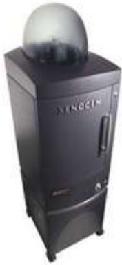
Perkin Elmer IVIS