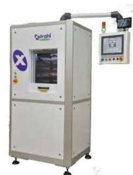
Xstrahl RS225 (Cell Irradiator)