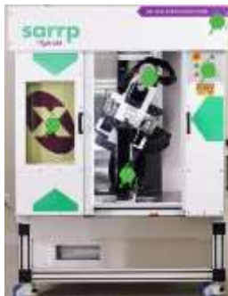
Xstrahl SARRP (Precision Image-Guided Animal Irradiator)