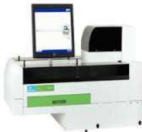
Perkin Elmer Wizard Gamma Counter